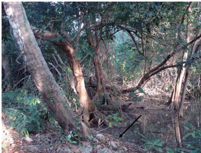
FIGURE 2: Study area on Ilha das Canárias.

The Parnaíba Delta matches a region of estuary characterized mainly by mangroves. At its mouth, the Parnaíba River forms a complex of approximately 70 islands. This complex is formed by five large islands distributed between two states: Piauí and Maranhão. The second largest island is Ilha das Canárias, belonging to the state of Maranhão (Figure 3B). This new record for Maranhão extends the distribution of L. natalensis to approximately 520km west of the Serra de Baturité, being the closest place this species was found.